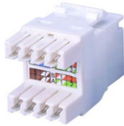
CAT 6E UTP