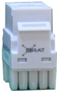
CAT 6E UTP