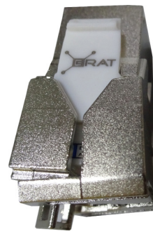
CAT 6A FTP